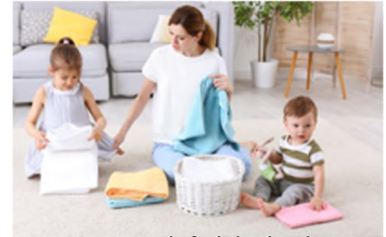
Keep and fold clothes