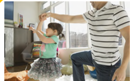
Make it fun with music