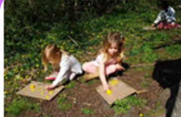
Create nature art