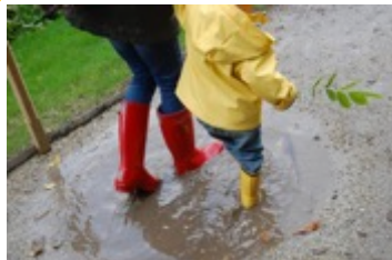
Jump in puddles