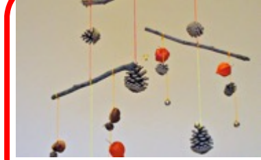
Create a nature mobile