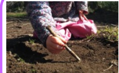
Marking in soil