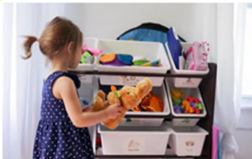
Putting toys away