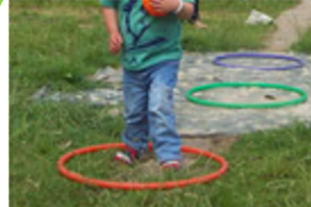
Hula hoop jumping