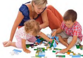
Make a jigsaw