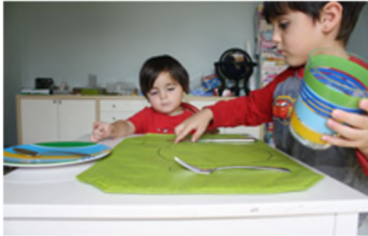
Lay the table