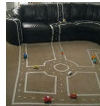
Create a road with tape