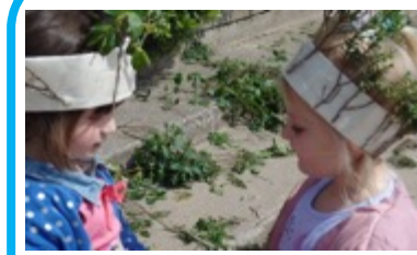
Design a crown