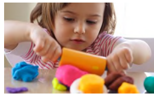
Play with clay