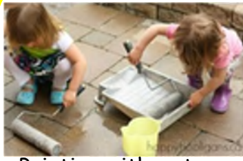
Painting with water